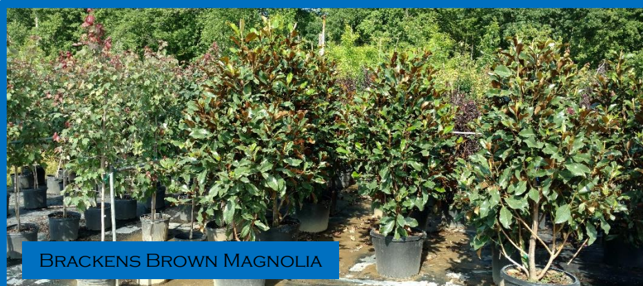
BRACKENS BROWN MAGNOLIA